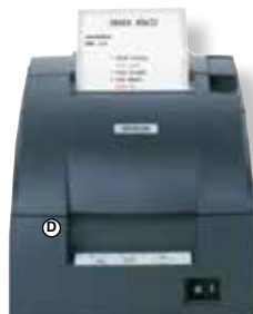
Optional EPSON TM-U220 Roll Printer

Call for Assistance in Configuring to Your New or Existing Meter Systems