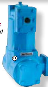
700740-20AF Air Eliminator/ Strainer

This meter will operate to 50 GPM, 150 PSI and -40° to 160° F. It carries an NTEP certification for resale. The ductile iron body has Stainless, Simriz Viton® and Teflon internals. It is available in any configuration with register, printer, air eliminator/strainer and preset with valve. The Veeder Root register reads in gallons and tenths to 10,000.