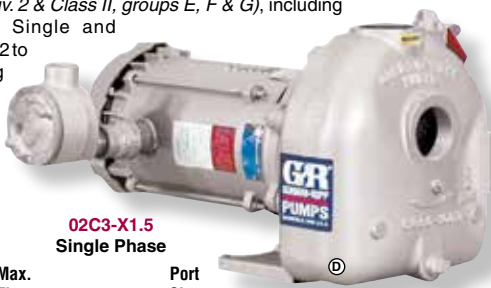
02C3-X1.5 Single Phase

Gorman-Rupp Explosion Proof, Self-Priming Centrifugal Pumps are designed for use in hazardous environments and/or for handling compatible flammable liquids. (Class I, Div. 2 & Class II, groups E, F & G), including gas and diesel. Single and 3-phase motors, 1/2 to 2 HP. Self-priming and equipped with Viton®, Carbon and Ni-Resist seals. Temperatures to 160° F. Rated to 1.0 S.G.