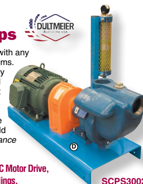
SCOT Pressure Seal Pumps with 3 Phase TEFC Motor Drive, Base Plate, Guard and Lovejoy Couplings.

Made to provide trouble-free performance with any liquid. Pumps will run dry without seal problems. Pump and Lucite Expansion Tank are factory assembled with 50% Ethylene Glycol and pressurized to 125 PSI. Pumps are straight or self-priming and available in pedestal, clutch or electric motor drive. Cast iron construction with sealed bearings and double viton mechanical pressure seal. Pumps should operate at 3600 RPM. Note: Follow maintenance instructions on the pressure seal system.