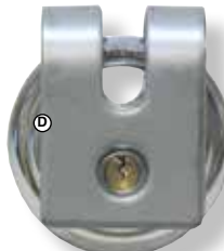
24RK70-613 shown with Lock Guard

24ST70 "Diskus" Padlocks. Stainless Steel construction with stainless shackle for extra protection. 2.2 mm stainless case is the strongest padlock in its class. 5-Pin cylinder. Diameter is 2-3/4". Locks are available keyed alike in a variety of key numbers.