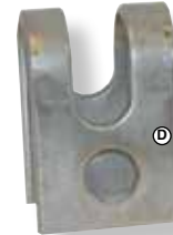
L500 Lock Guard

L500 Lock Guards are stainless steel construction and give additional protection against bolt cutters, hammers and tampering.