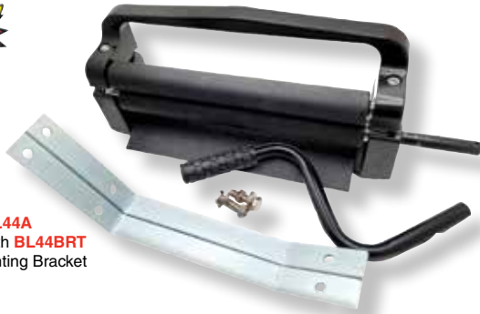
BL44A Shown with BL44BRT Wall Mounting Bracket