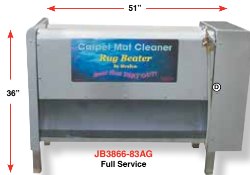
JB3866-83AG Full Service