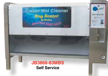
JB3866-83MBS Self Service

The Rug Beater™ is the "standard of the industry". Unlike any other competitive machine, the Rug Beater™ "BEATS" the dirt, sand, grit, ice, snow, salt, pet hair, and many other substances from the rug, as well as cleans and combs while fluffing, puffing and raising the nap. Again, this is the only Mat Cleaner that REALLY WORKS!!!