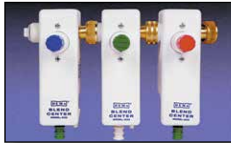
(3) 633 Valves mounted together.