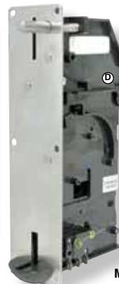
9000 Series Mechanical with Coin Switch & Bracket