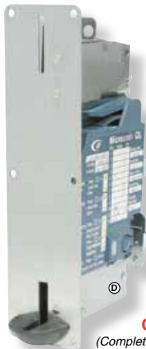
QLC (Complete Mechanism)

Standard with 2" x 7-3/4" industry standard faceplate. Rated for 24-volt timer pulse and input. Accepts coins from 16mm to 34mm diameter and 1.0mm to 3.4mm thickness. Units can be easily opened up for cleaning.