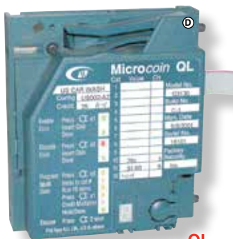
QL (Insert Only)

Electronic, multi-coin, coin mechanisms from Microcoin . Can be programmed to accept up to 9 different coins or tokens. Will work with U.S. or foreign coins if desired. High coin acceptance rate, (up to 8 coins per second) means less jam problems.