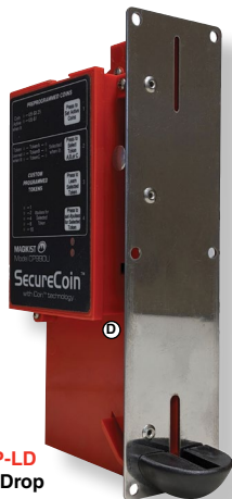
EP5P-LD Long Drop

Standard Features: Touchpad programming • Auto-learning, no sample coins needed • Waterproof and tamper-proof • Built-in panel display • Solid-state electronic circuit • Long or short drop versions • Maintenance-free, only one moving part • 1-Year Warranty.