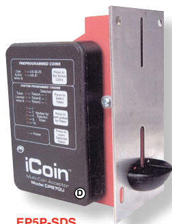
EP5P-SDS Short Drop

Electronic, Multi-Coin Mechanisms from the manufacturers of Secure Coin. Takes up to 5 different coins or denominations. Pre-programmed for US quarters and dollars and up to three other coins or tokens of your choice. Can also be easily set to accept Canadian coins or other foreign coins.