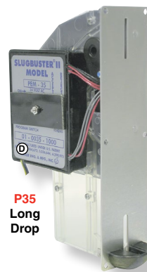
P35 Long Drop

Slugbuster® Electronic Coin Mechanisms. Solid-state design enables these units to weigh, electronically size & accept a preferred coin or token. EZ Version allows for easier access to coin mechanism than old version mechanisms. 24 Volt. P35EZ Slugbuster I - "Quarters Only" . Compares the coin in the holder with the coin to be accepted, (American or Canadian).