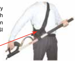
D20015 Support Belt

Features: Units assembled and ready to hook-up • Trigger spray gun • High pressure hose • a • Adjustable extension • Rated to 10 GPM • Rated to 4000 PSI • Rated to 195° F.