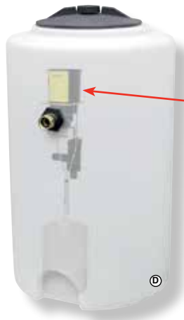
Mixing Valve mounted inside tank

Automatic Liquid Supply Tank. No more hand mixing, this tank will do it for you!! Heavy-duty plastic construction. Standard with a 5 or 10 gallon per minute Hydrominder valve for exact mixture of solutions. Diameter is 16" x 28" high. Standard with a 8" locking lid. Note: Discharge from tank can be through the top or a bottom fitting (not included but can be supplied).