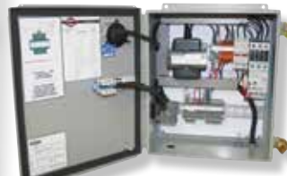
EP50A-53 Electrical Panel

Standard Features: Cat Pumps® Plunger Pump, 5 HP, Baldor motor • Unloader valve • Belt tightener • Stainless steel baseplate and belt guard • 50' high pressure gun hose • Trigger spray gun • Insulated extension • Pressure gauge • Gun swivel. Units are pre-plumbed and tested prior to shipment. Stand units include stainless steel frame and stainless steel tank with hydrominder valve. (EP Units include demand electrical panels for auto shut down).