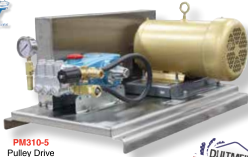
PM310-5 Pulley Drive Prep Unit - No Tank